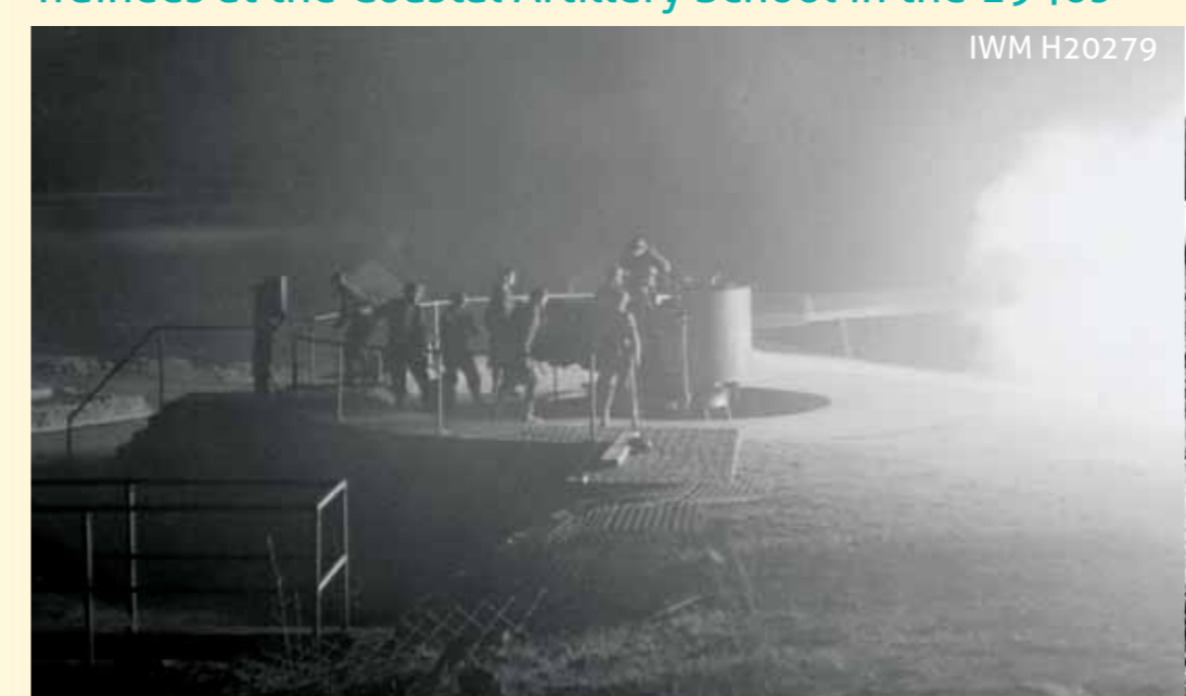
Hyfforddeion yn yr Ysgol Danio Arfordirol yn y 1940au Trainees at the Coastal Artillery School in the 1940s