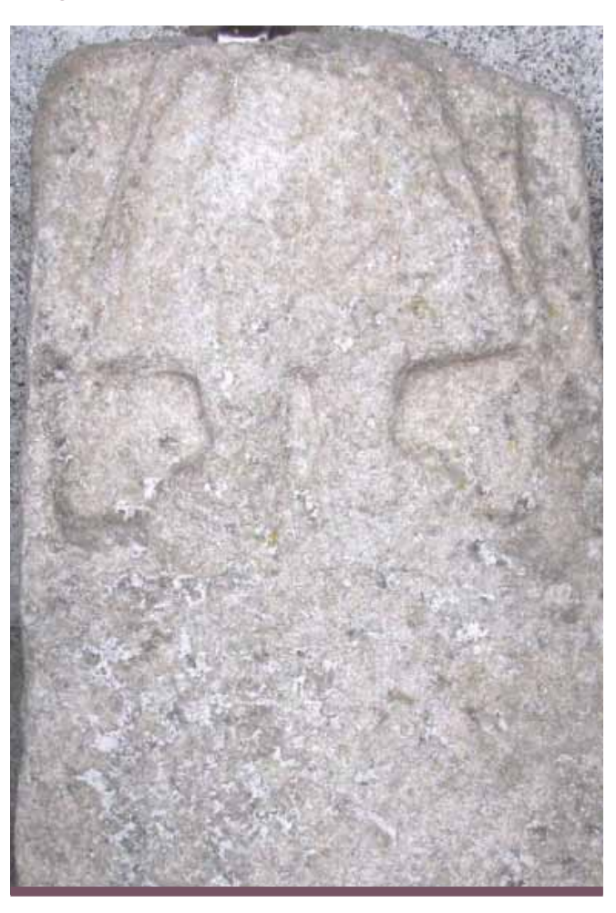
A gravestone with a pilgrim's costume on it (Ynys Enlli)

Christianity reached Llŷn early on, and part of the evidence of that are the numerous memorial stones. The most significant are the two now in Aberdaron church, namely Cerrig Anelog. There are also two stones from this period in the chapel on Enlli / Bardsey, one probably a gravestone and another a stone with a cross on it. Llangwnnadl church has a stone with a cross on it as well.