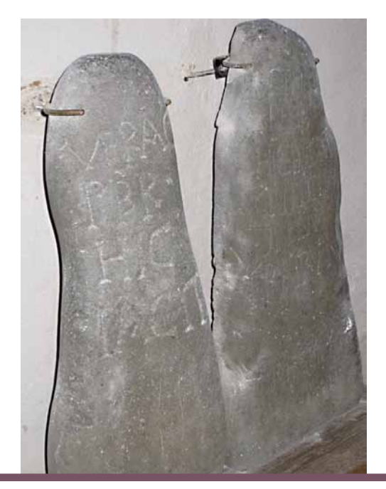
Directions: In Aberdaron Church, in the middle of the village.

They were discovered on the slopes of the mountain, Mynydd Anelog. The chapel of Capel Anelog is probably on the land of Gors, Anelog (SH 156274) and it was the clas of Aberdaron. The stones were kept safely at Cefnamwlch, Tudweiliog and then moved to Aberdaron Church. The inscription on them probably dates back to the late C5th or early C6th.