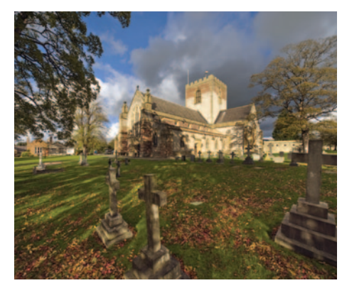
St Asaph Cathedral

Drive up to Uwchmynydd and pass by Y Gegin Fawr where pilgrims rested before crossing to the holy island of Bardsey . Legend has it that this small and tranquil island is the burial site of 20,000 Welsh Saints!