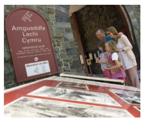
National Slate Museum

On reaching the main road you will see the Snowdon Mountain Railway Station (7) . Finish at the Electric Mountain (8) visitor centre and take a tour of the power station. There is also an Our Heritage exhibition here.