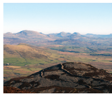
Tre'r Ceiri

From the café follow the road and Coast Path signs (a shell) and on to the beach. Turn left and follow the coast path signs up through woods to Ciliau Isaf (4), cross over the stile before the farm and follow the farm track. Just before reaching the main road turn left over a stile and follow path marked Pilgrim's Way back to the car park (1).